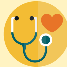
Additional Accidental Daily Hospital Cash Benefit involving Public Transport