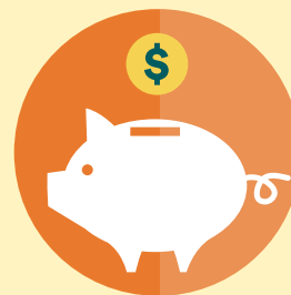
Refund of Premium