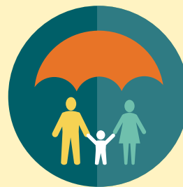
Extra Discount for Protection of You and Your Beloved