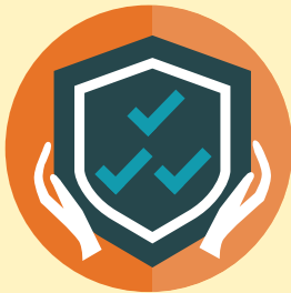
Choices of 10 plan levels