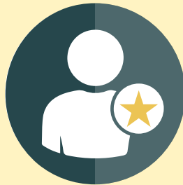
Additional Accidental Daily Hospital Cash Benefit